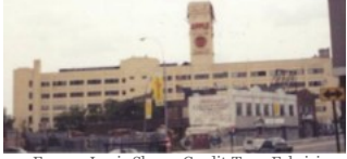
Former Louis Sherry