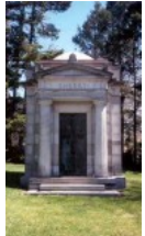
Louis Sherry Mausoleum