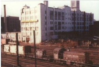
Louis Sherry, trackside 1960s.

What commodities were shipped in and out of Louis Sherry in the 1960s remains a mystery for now. While ice cream may seem a reasonable guess, I hesitate to guess that this facility was different from its neighbors who rarely shipped out any freight by rail.