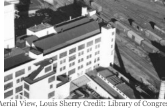
Aerial View, Louis Sherry