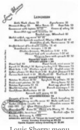
Louis Sherry menu