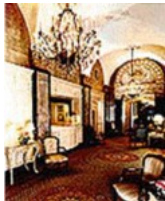
Lobby, Sherry-Netherland Hotel