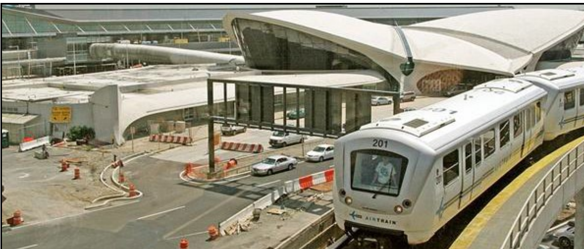
An AirTrain shuttle, like this one at John F. Kennedy International Airport, may soon come to LaGuardia Airport as well.

Editor's Note: Follow up discussion on this topic on social media has indicated the proposed connection to MTA LIRR and MTA Subway to be in the vicinity of the #7 Subway and LIRR Port Washington Branch near Mets - Willets Point Station (formerly Shae Stadium / New York World's Fair Station).