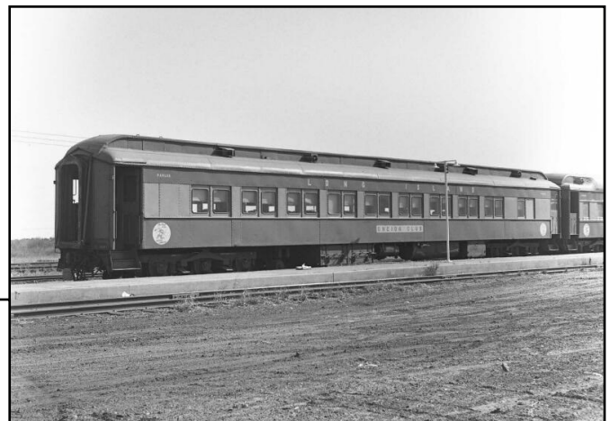
ONEIDA CLUB laying up at station platform at Montauk, NY in 1969