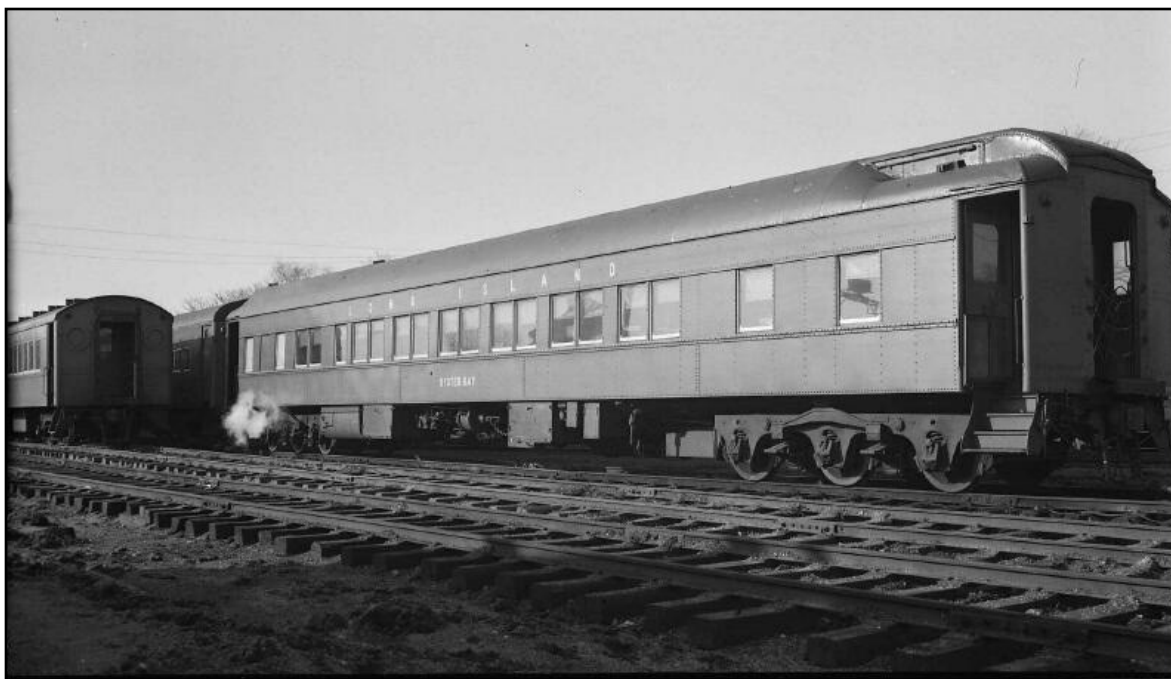
Club car OYSTER BAY is laying up in its namesake's yard on 1/03/1959.

These 16 cars were then used to make up westbound trains returning to New York on Sunday, Monday and Tuesday.