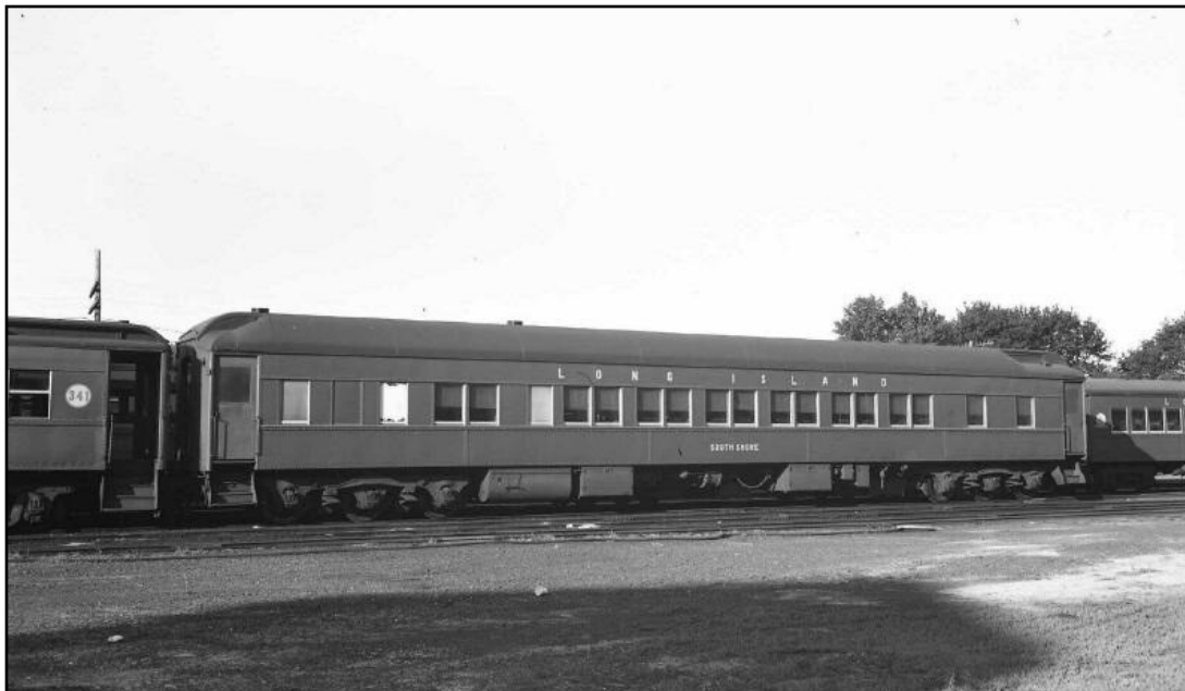
Club car SOUTH SHORE is catching the early morning light of a summer day in the yard at

Merry Christmas and Happy New Year from the Long Island Rail Road Modeler! And happy modeling! Don't forget--my first book of two volumes by Morning Sun Publishing on LIRR MU cars—1905 to 1947 and in color—will be available from the chapter in April 2020. I can't wait!