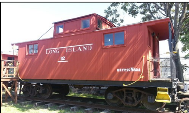
N-52 #12 at the Oyster Bay Railroad Museum