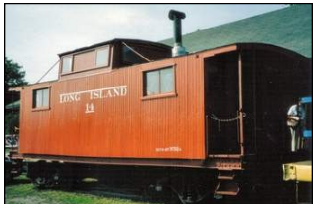
N-52 #14 at the Railroad Museum of LI, Greenport