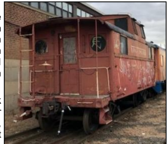
N-5 #2 at Holban Yard just prior to being sent off for scrap in January, 2019.

For many years the LIRR cabin car fleet consisted of the N52 and the N52A wooden cabooses that were very similar to the N5 steel version. These cabin cars have been made in HO scale by N. J. Custom Brass in brass and without trucks and a resin kit was offered by Funaro & Camerlengo. Basically, the railroad's N52 and N52A were wooden versions of the N5 with a wooden body on a steel underframe.