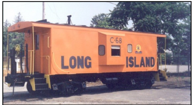
N-22B #68 at Railroad Museum of LI, Riverhead

I'll continue with my series next time. Until next time, happy modeling!