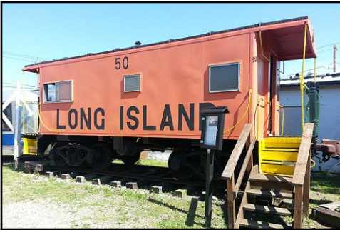
N-22 #50 at Oyster Bay RR Museum

In 1958 the railroad moved big-time into steel cabooses with six steel cars built by the International Car Company that were classed as N22. These cabin cars were really a transfer caboose design with flat sides and no bay window or cupola. The LIRR cabin cars were numbered 50 through 55. The same design was used by the Boston & Maine Railroad and these cars were practically identical. The design was tweaked just a bit and a few years later, in 1961, the LIRR received six more cars. These cars had differences in the grab irons on the car end and the windows were just a little larger, including the third window on one side of the car. These cabin cars were numbered 56 through 61 and were class N22A.