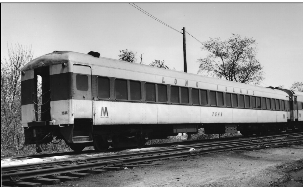
All photos obtained online from Google search.

Sadly, after a long successful history, the program ended (the fellows and gals I commuted in with jokingly stated that the entire LIRR commuter population received their degrees, and no one was left to attend!!!). I honestly believe that if this type of program, however modified, was still in existence or reinstated, it would be heavily attended (efficient use of time, etc.).