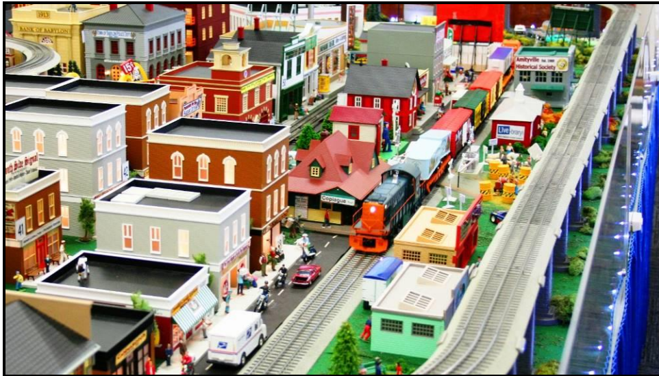
This is a 2018 image of a part of the Babylon Town Hall Museum layout.

We again apologize for the computer failure during the November meeting. The failed hard drive will be available to view at the December meeting. In order to save our limited bandwidth, we ask all of our local members to attend in person.