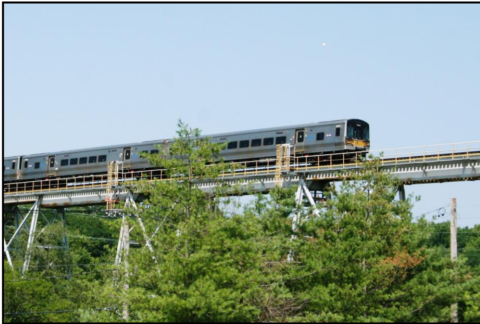
LIRR Train 422 with MU Engine 9934 on the Manhasset Viaduct, July 25, 2014

In order to save our limited bandwidth, we ask all of our local members to attend in person.