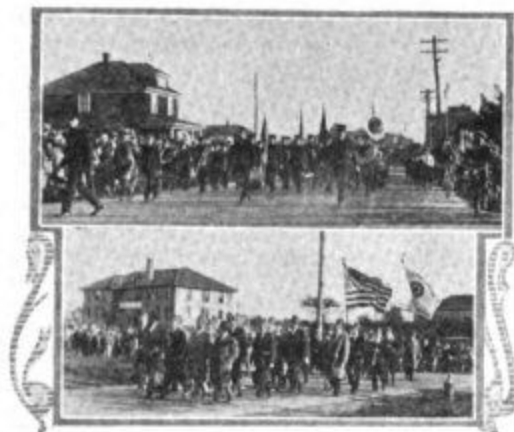
Top View—Start of Parade in Mineola. Bottom—Lions and Rotary Club members grouped together in march through streets of Mineola.

Hempstead Gardens was reached at 2:48. The town was garbed profusely in color for the occasion. West Hempstead hove into view at 2:55, where a most ostentatious celebration was indulged in.