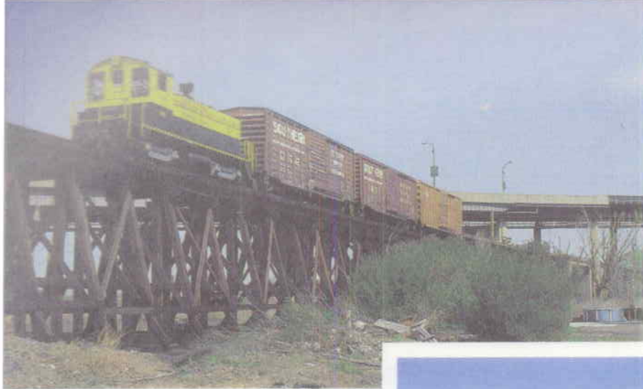
LEFT: Staten Island Railway train AL-1 has just crossed the Arthur Kill River into New Jersey, and negotiates a wooden trestle at Bayway, N.J., on April 20, 1986. The train has several empty freight cars in tow for the Conrail interchange at Staten Island Junction in Cranford.