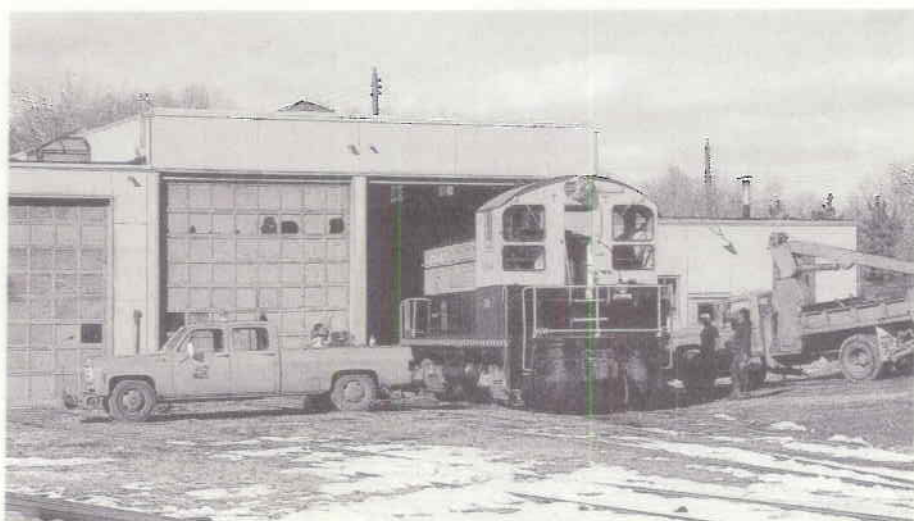
BOTTOM: Finis . RV-1 is passing through Kenilworth on the last day of operations on April 21, 1992.