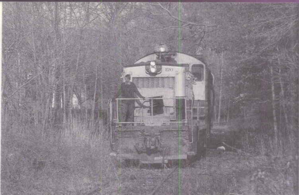
TOP: Train RV-1 trundles through Aldene, N.J. on January 6, 1992, with a pair of empty covered hoppers for the Conrail interchange at Staten Island Junction in Cranford.