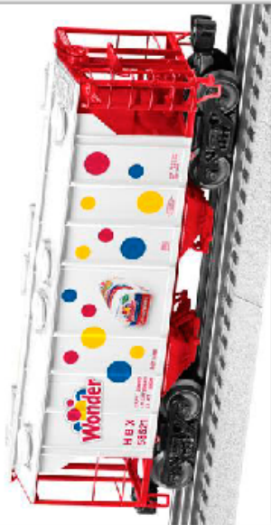
Graphics may differ slightly from above - track not included, © RMLI 2011 Wonder ® is a registered trademark of Hostess Brands used under license.

The Railroad Museum of Long Island (RMLI) is pleased to announce the twelfth in our series of Lionel O gauge commemorative cars. Production of this car will be extremely limited to only those who purchase this car in advance. Funds raised from the sale of this car will go toward the operation of the Museum, including education/restoration programs, exhibits, collections and the Historic Lionel Layout