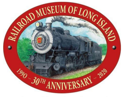
Our Thirty-fourth Year! www.rmli.org

The Railroad Museum of Long Island Riverhead Restoration Site & Visitors Center opens for the 2024 Season on Saturday, April 6, 2024 at 10:00 AM - 4:00 PM. The Greenport Museum and Saturday/Sunday openings to the public begin Memorial Day Weekend, May 25/26, 2024. Unveiling of a William G. Pomeroy Foundation Historic Transportation Marking will take place at Greenport RMLI on Saturday, July 27, 2024. Time of the unveiling will be coordinated with the arrival of the LIRR 180th Anniversary Excursion Train.